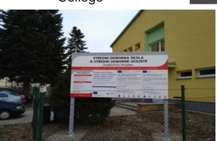
Hall of professional training and practice